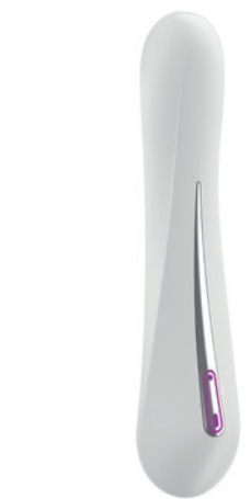
matt white - glossy chrome